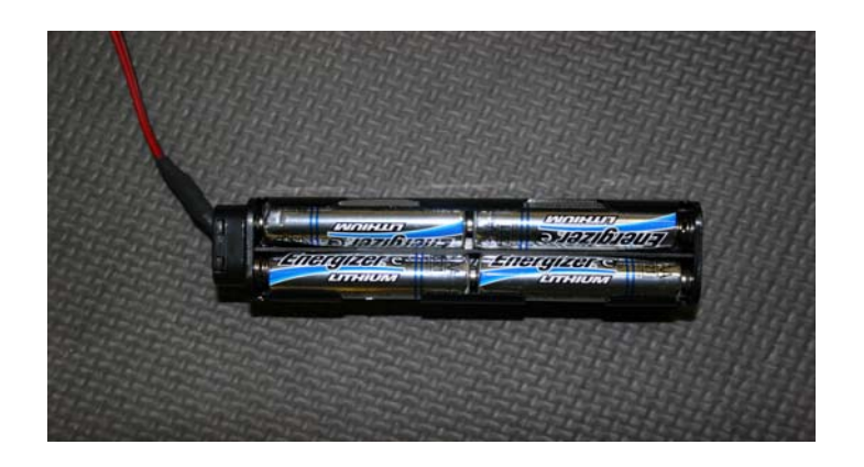
AA Lithium batteries last much longer than Alkaline Batteries. <u>Firmly insert</u>

We also include a AA battery holder for back-up power if you aren't able to recharge your NiMH rechargeable battery.