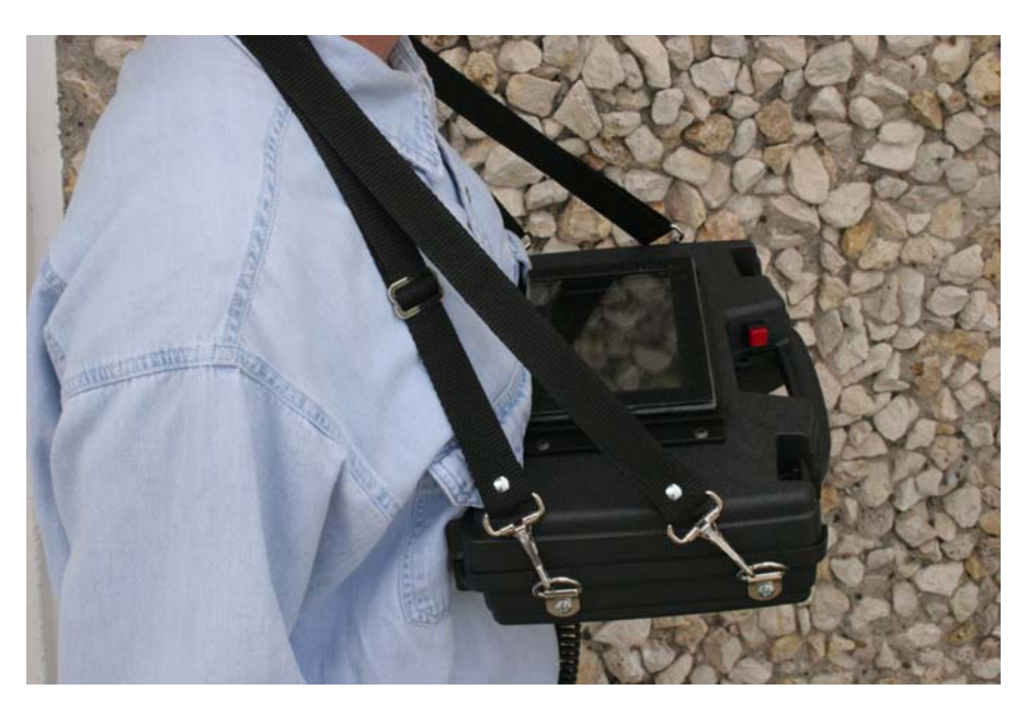
FOR BETTER STABILITY USING THE CHEST MOUNT, CLIP ONE STRAP TO THE TOP "D" RINGS AND ONE STRAP THE BOTTOM "D" RINGS AND ADJUST ACCORDINGLY